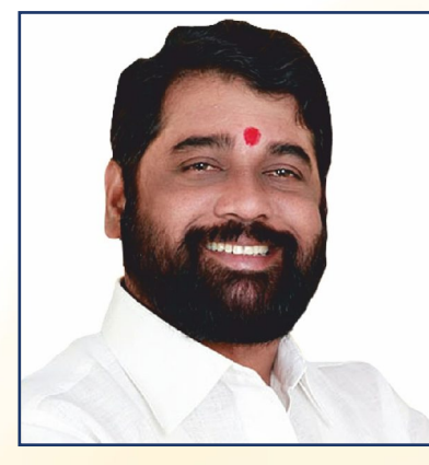
Hon. Shri. Eknath Shinde Chief Minister, Maharashtra State