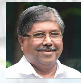
Hon. Shri. Chandrakant Patil Minister, Higher & Technical Education, Government of Maharashtra